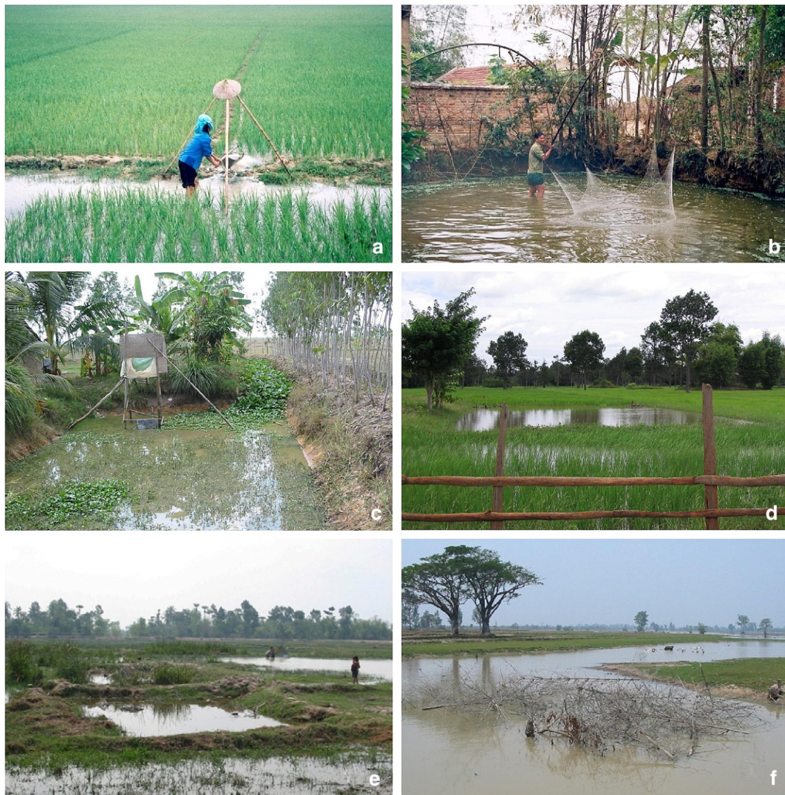
Fig. 1. Farmer managed aquatic systems (FMAS): (a) rice fields, Vietnam; (b) household pond, Vietnam; (c) household pond (with latrine), Cambodia; (d) pond in rice field, Thailand; (e) ponds in lake, Cambodia; and (f) bid rent pond (with brush park), Vietnam.

typically open to the wider aquatic environment and thus sustained or trapped wild aquatic animals. Cambodians distinguish between two types of household ponds: larger ‘ponds’ and small ‘ditches’. Vietnamese household ponds were on average larger than those found in Cambodia (GLM, p < 0.05 ), closed to the wider aquatic environment, and used intensively for aquaculture of CS.